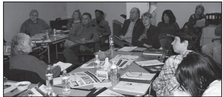
CNY UUP members attended Advocacy Training Day at the UUP Chapter Office October 7, 2008