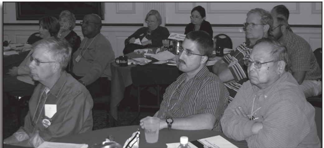
SUNY Upstate was well represented at the UUP Fall Delegate Assembly September 19-20, 2008 in Albany, New York

The Fall Delegate Assembly was held at The Desmond Hotel in Albany, NY September 19-20, 2008. Some highlights of this meeting include the following: